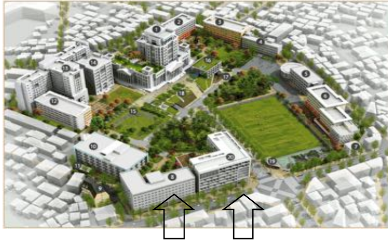
Faculty Office Building I (2 nd floor: Cafeteria)